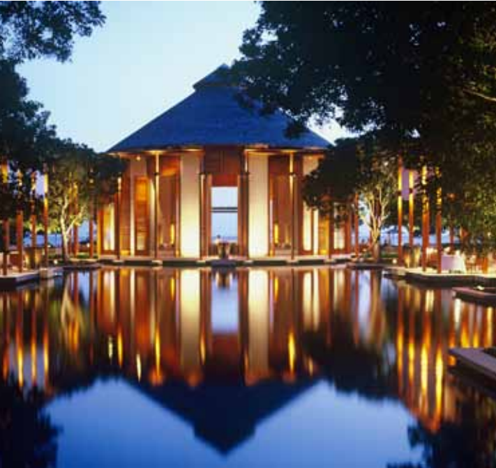
The Amanyara Resort