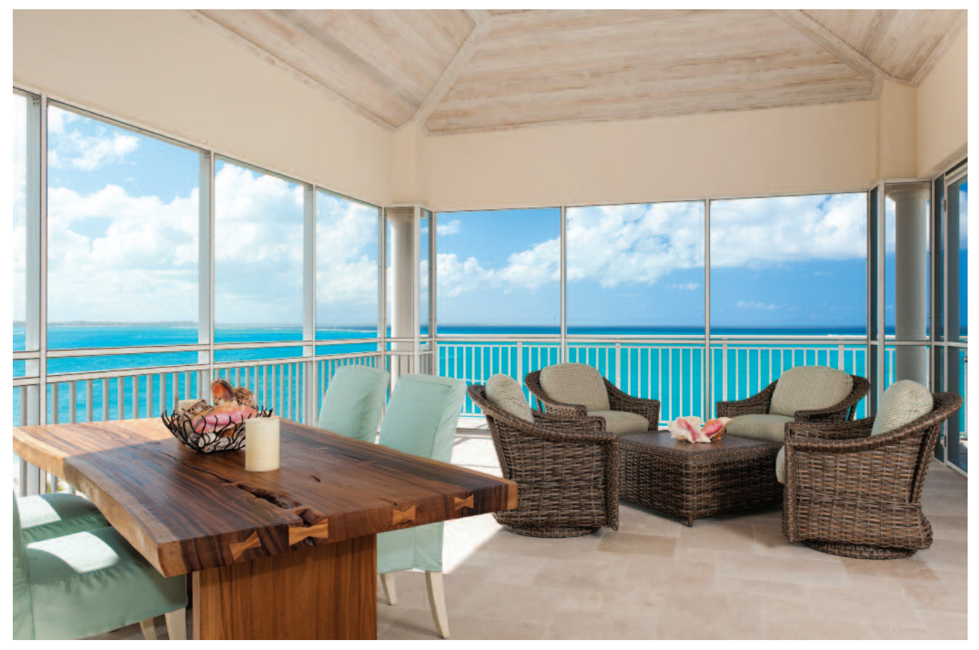
Opposite page: The Venetian on Grace Bay (at top) occupies the far eastern end of Grace Bay Beach. Just to the west is its successful sister property The Tuscany. Above: Each of the 27 oceanfront suites includes a huge screened terrace offering panoramic views.